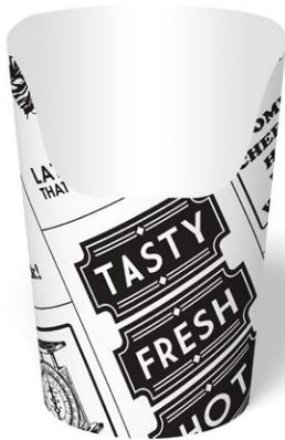
Newspaper™ (rotating design)

*Ounce sizes are approximate dry weight measurements.